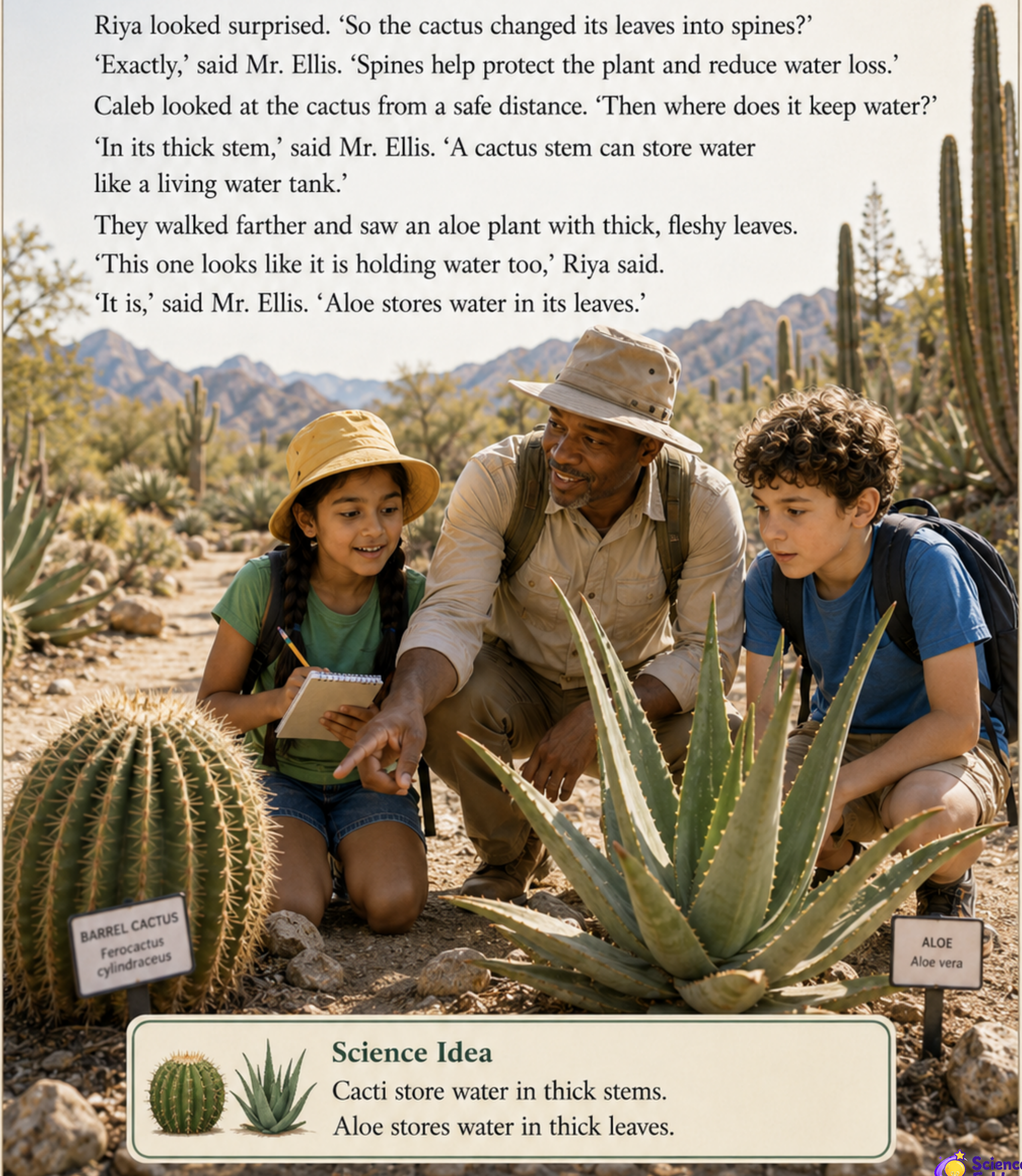
BARREL CACTUS Ferocactus cylindraceus